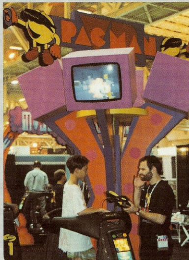
Pac-Man is Virtuality's great hope

And for VR manufacturers, dreams of selling linked multi-player units, offering teamed VR scenarios as well as the possibility of better game content (due to the involvement of Microsoft) seem problematic due to the technology's past history.